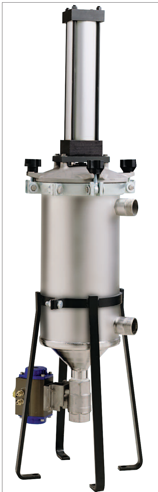
Eaton's DCF Self Cleaning Filter: The DCF mechanically cleaned filters operate at a consistently low differential pressure and deliver simple, reliable operation in which a low initial investment is a key driving factor.

For more information visit: www.eaton.com/filtration